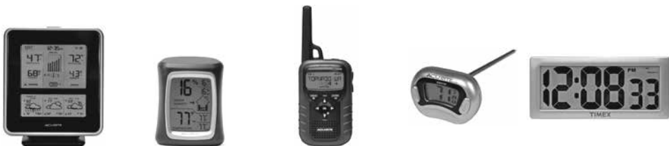
Weather Stations Temperature & Humidity Weather Alert Radio Kitchen Thermometers & Timers Clocks